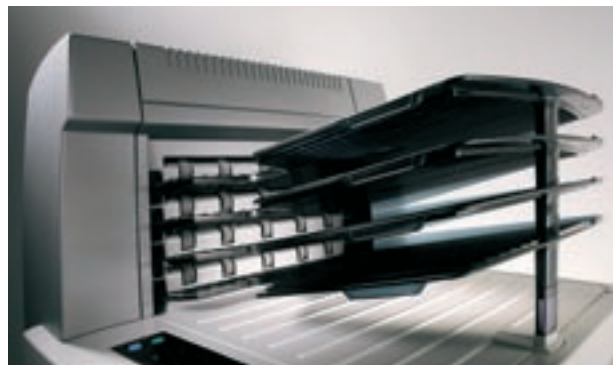
Unique sorter eliminates high-traffic bottlenecks

DRYSTAR 5503 features multiple-format handling, with the three most popular media sizes and/or types permanently on-line. The imager is thus capable of delivering CT, MRI, DSA, digital R&F, CR and DR images at high speed onto different DRYSTAR DT2 media. The DRYSTAR 5503 comes with three input trays. Every input tray can use five different film formats, ranging from 8 x 10" to 14 x 17", making the final image versatility of this stand-alone, small footprint unit remarkable. And what DRYSTAR 5503 gains in versatility, the user gains in convenience and time.