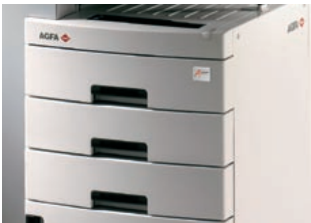
Three media trays for different on-line media sizes