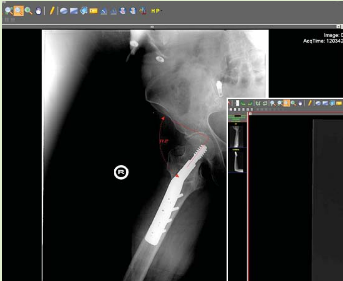
ANGLE MEASUREMENT TOOL

TAKING ORTHOPEDIC WORKFLOW WHERE YOU WANT IT TO GO